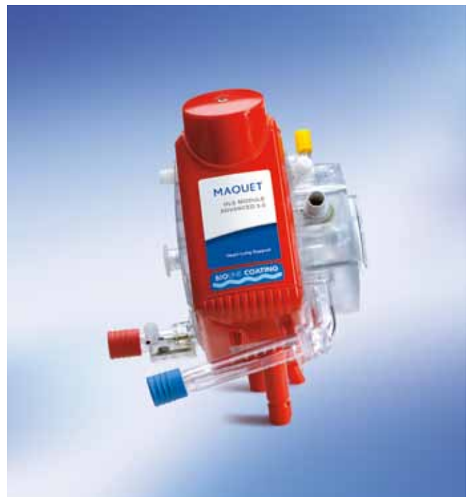
HLS Module Advanced

The core of the HLS Set Advanced, the HLS Module Advanced, is the world's first oxygenator with an incorporated low-trauma centrifugal pump and an infrared sensor to measure venous oxygen saturation (SvO 2 ), hematocrit (Hct), hemoglobin (Hb) and venous temperature (TVen). Previously these parameters could only be measured using an external blood gas analyzer or a sensor in the venous blood line. Sensors to measure three pressures and the arterial temperature are also integrated into the module, thus avoiding the need for external measurements, improving accuracy and reducing the risk of air emboli and thrombus formation.