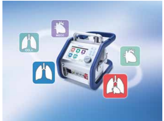
CARDIOHELP – the multi-therapy solution

With a weight of about 10 kg CARDIOHELP is the perfect solution for intra- and inter-hospital patient transport: