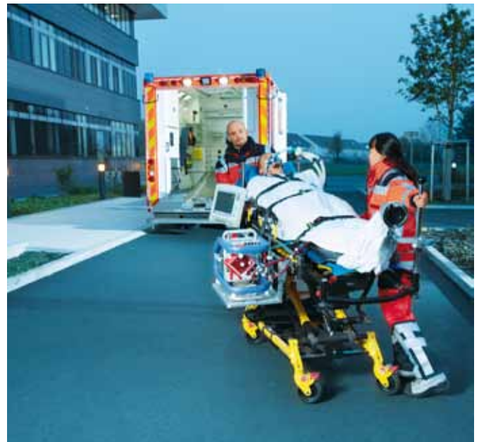
CARDIOHELP – a perfect solution for patient transport