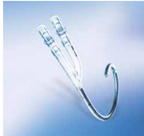
AVALON ELITE Bi-Caval Dual Lumen Catheter

The AVALON ELITE Bi-Caval Dual Lumen Catheter is the state-of-the-art catheter for veno-venous ECLS and is now part of the Maquet product range. It is the world's first percutaneous wire reinforced dual lumen catheter for extracorporeal life support and thus has superior kink resistance. The catheter is inserted into the internal jugular vein and matches the body's natural flow ratios by simultaneously removing blood from both, the superior vena cava (SVC) and inferior vena cava (IVC) and returning blood to the right atrium. A large family of sizes as well as the Avalon Elite Vascular Access Kits are available.