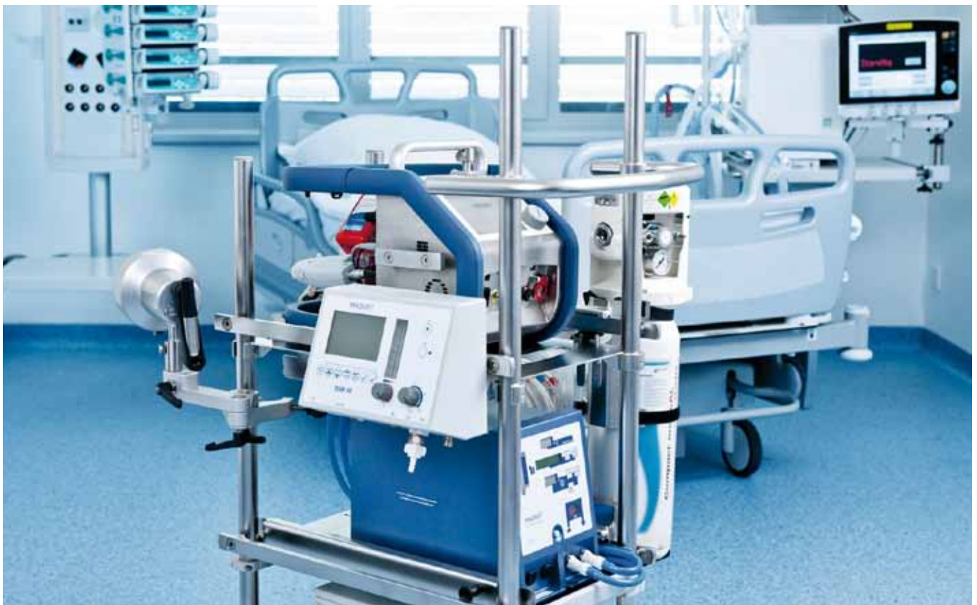
HLS Set Advanced in an ICU environment