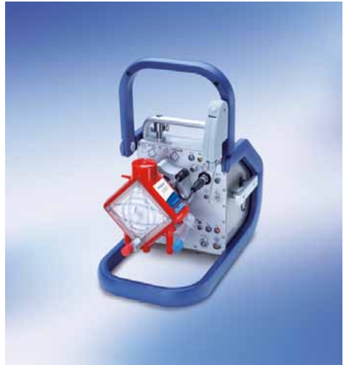
HLS Module Advanced mounted on the CARDIOHELP

The HLS Set Advanced is available in two versions: HLS Set Advanced 5.0 with a blood flow of up to 5 l/min and HLS Set Advanced 7.0 with a blood flow of up to 7 l/min. Both sets have a biocompatible BIOLINE Coating. The HIT Set Advanced with SOFTLINE Coating is available for patients who are susceptible to heparin-induced thrombocytopenia.